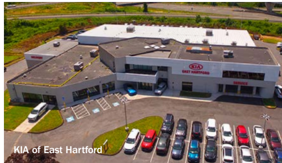
KIA of East Hartford