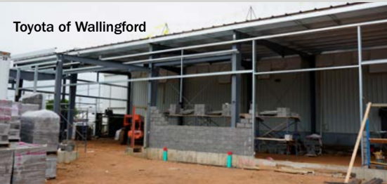
Toyota of Wallingford

The majority of the work completed thus far consisted of basement demolition and abatement. A large masonry wall was completely removed in order to open up space in the lower level. Currently, the Munger team is working to replace rotted out structural support beams and adding additional structural steel to the ceiling. A water mitigation membrane is being installed around the perimeter of the lower level to prevent moisture from getting into the interior of the building. Current exterior construction involves the concrete footing work necessary for the new handicap walkway. Construction is anticipated to be completed by late winter/early spring of 2020. Munger is honored to be involved in the modernization of this historical landmark in the community.