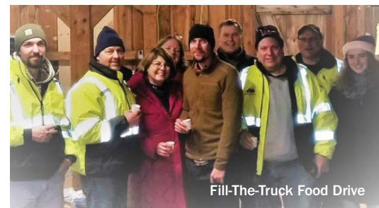
Fill-The-Truck Food Drive

And what's been going on outside of our Munger business??? On Saturday, December 16, 2017 Munger took part in the annual Fill-The-Truck Food Drive with the Guilford Vet to support the Guilford Food Bank. This is the 12th year we have participated and once again the turnout and support was amazing. Both the Munger box truck, and a second truck donated by Bishop's Orchards and Farm Market were filled to capacity by generous citizens in our community. We are humbled and honored to be a part of this each year and we thank all Munger employees who gave their time, treasures, and food items to support this community event.