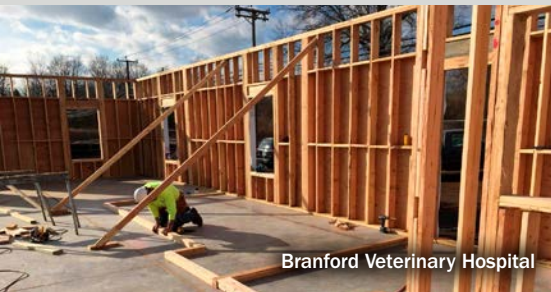
Branford Veterinary Hospital

The project is anticipated to be completed in May 2018. Munger Construction is