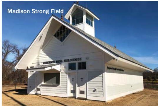
Madison Strong Field