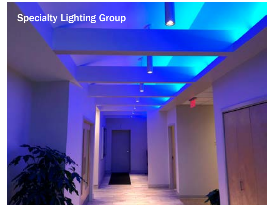
Specialty Lighting Group