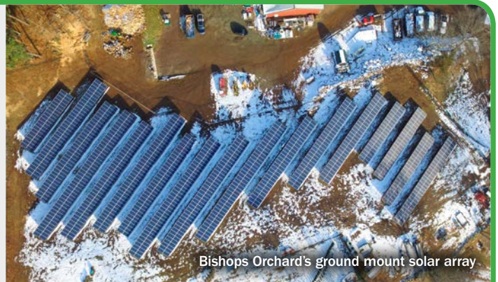
Bishops Orchard’s ground mount solar array