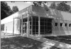
University of New Haven

The new building’s 28 ft. storage height significantly increases the capacity to bring in products for different end users. An 8” structurally reinforced slab handles excessive freight weights, and the oversized EFSR fire protection sprinkler system allows for storage of a variety of different commodities without requiring in-rack sprinklers.