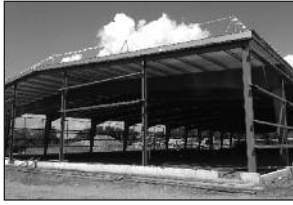
All Panel Systems

for construction of two new buildings on a higher elevation than the rest of the yard so museum piece trolley cars and cars being renovated can be stored safely throughout the year.