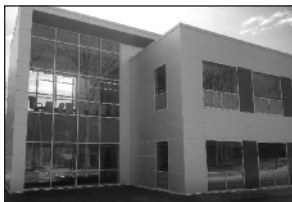
The Lee Company

The recent completion of Building 3H at The Lee Company, 2 Pettipaug Rd., Westbrook added to Munger's extensive list of projects completed for The Lee Company throughout the last 10 years. The 17,820 SF, building provides office and meeting spaces for The Lee Company's sales and marketing