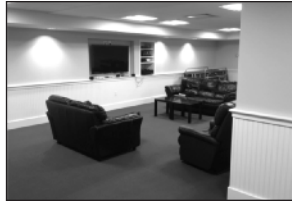
New Canaan Firehouse