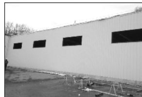
Burt Process Equipment Inc.

In the Fall of 2013, Munger installed a PV solar system for repeat customer, Burt Process Equipment Inc., Overlook Drive, Hamden . Currently construction is almost complete on a 19,760 SF addition to the existing building. Burt Process designs, manufactures, and distributes high purity and corrosion resistant