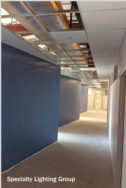
Specialty Lighting Group

It is exciting to watch the complete transformation of this industrial building as we near completion of the project.