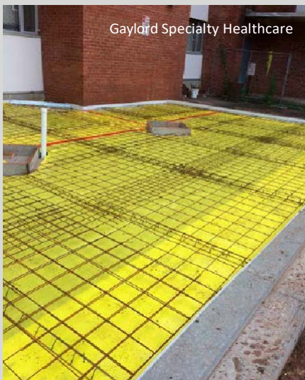
Gaylord Specialty Healthcare

The interior boasts steel studded block walls, with a completely fire-proofed room. Half the building is required to be a sterile environment for medical purposes, which posed the need for specialty air-tight doors. Extensive HVAC and sprinkler systems were necessary to fulfill the medical protocol as well.