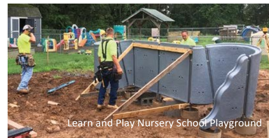
Learn and Play Nursery School Playground