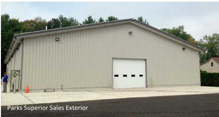
Parks Superior Sales Exterior